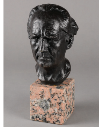
Bust sells for $365 with proceeds benefiting the Friends and the Atascosito Historical society.